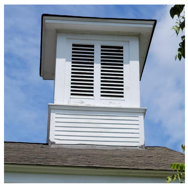
Bell Tower Detail