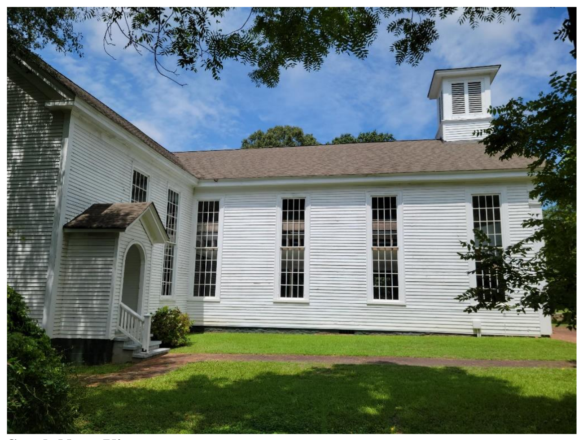
South Nave View