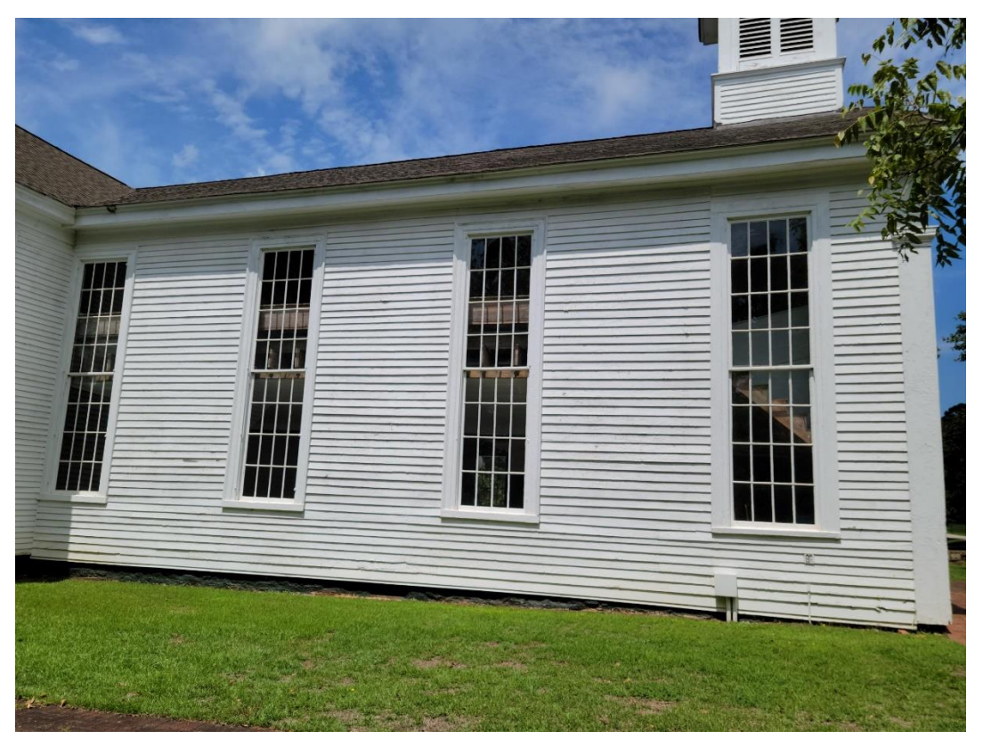
South Nave View