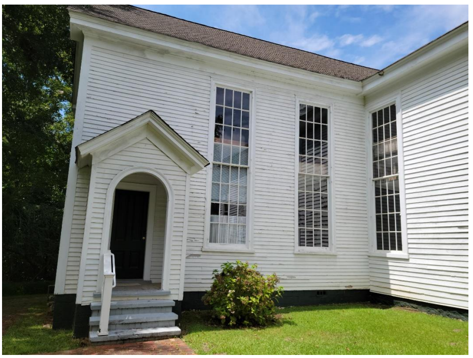
North Transept Detail from the East Side