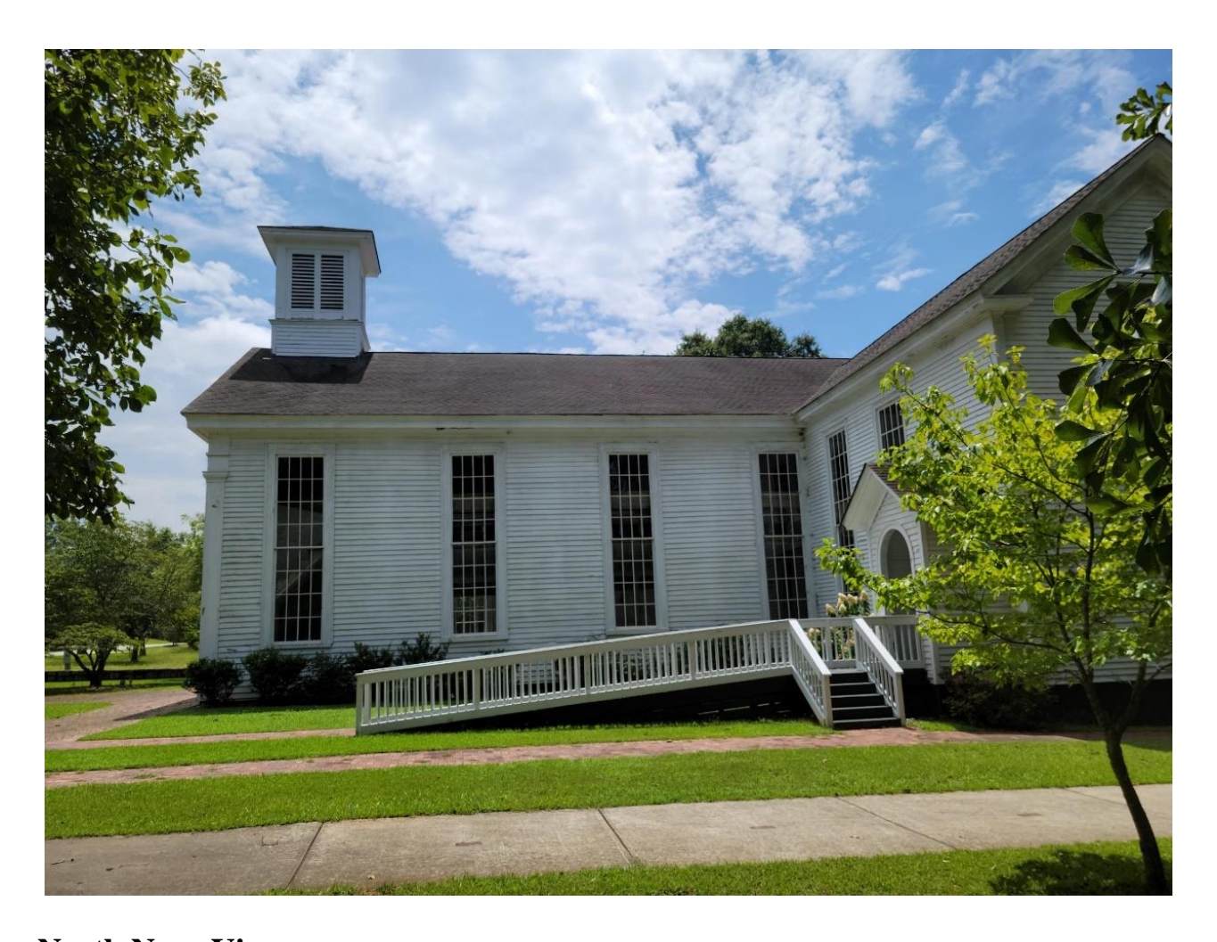
North Nave View