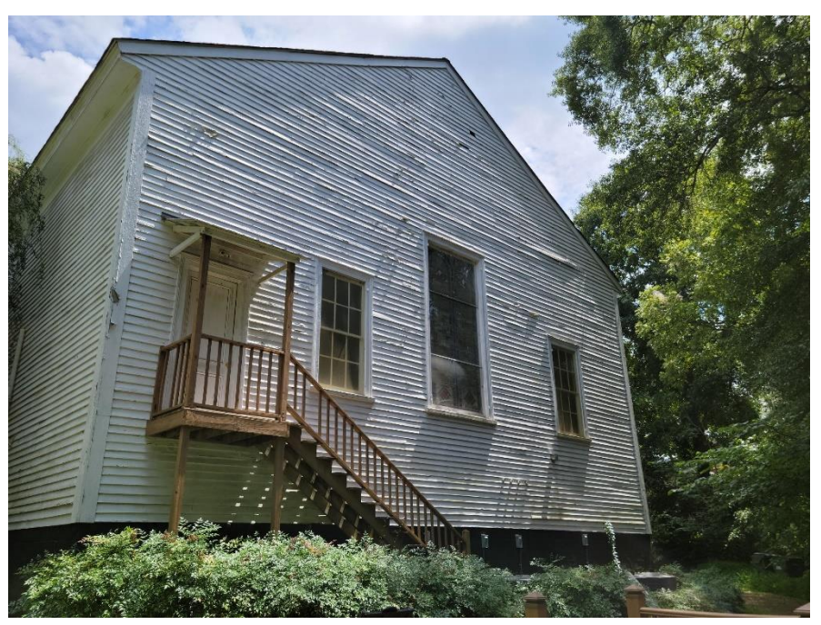
West Rear Side View