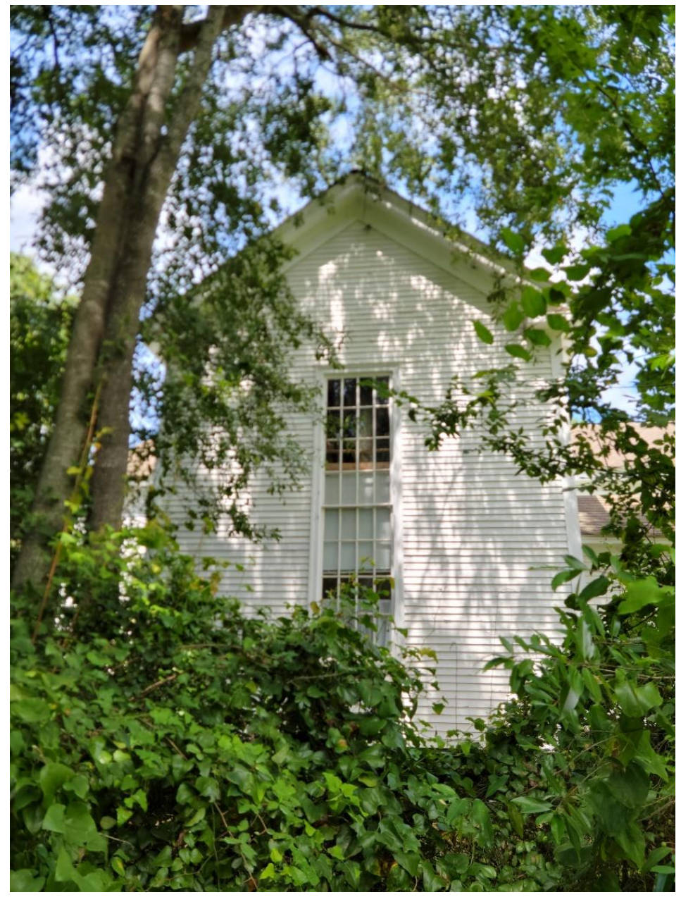
South Transept View – Foliage will be trimmed as necessary by City Staff