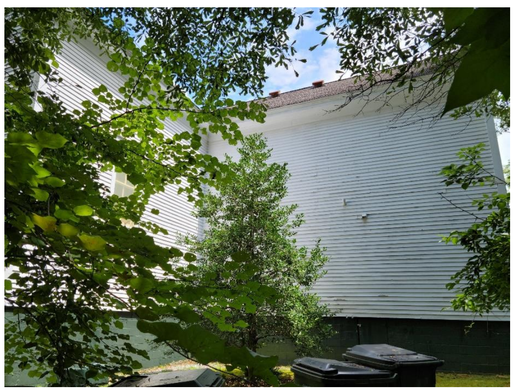
West Rear and South Transept View – Tree will be removed as necessary by City Staff