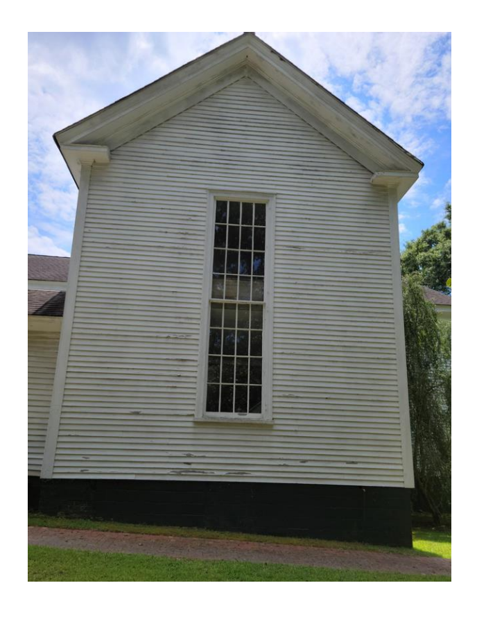
North Transept View