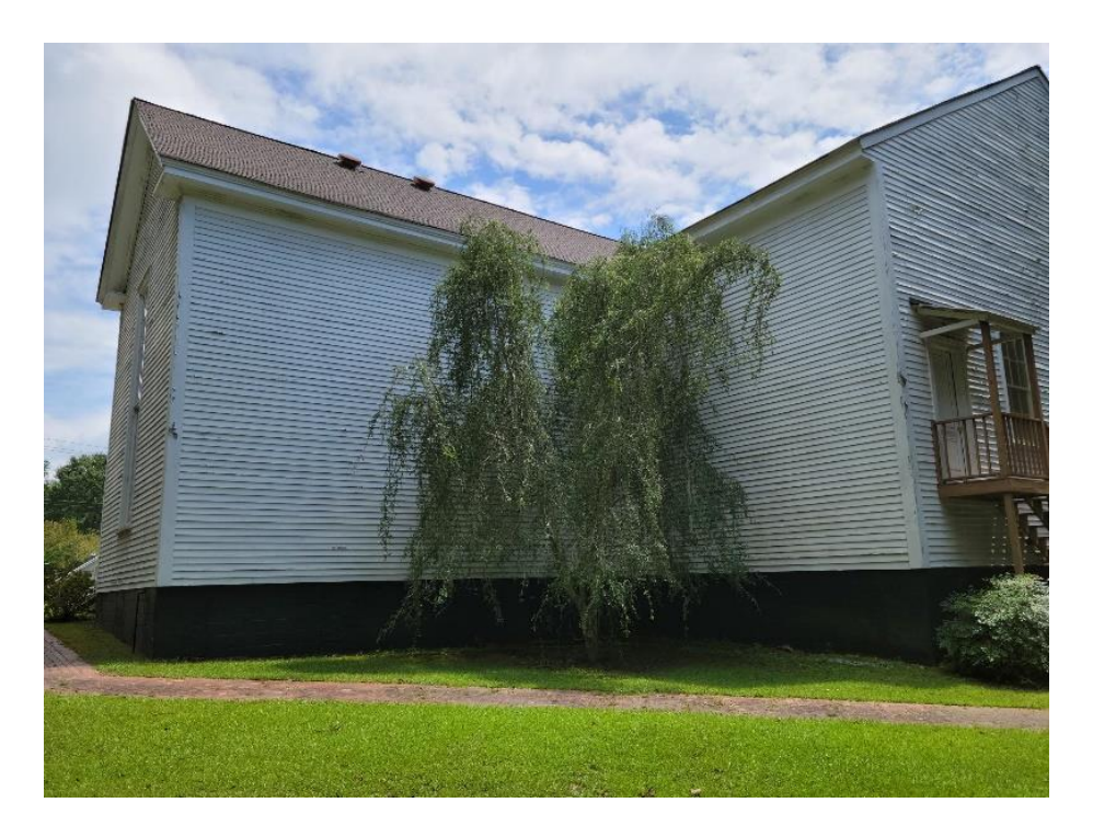
West Transept View – Tree will be removed as necessary by City Staff